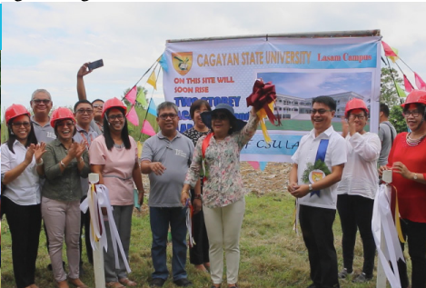
Two-Storey Academic and Laboratory Building